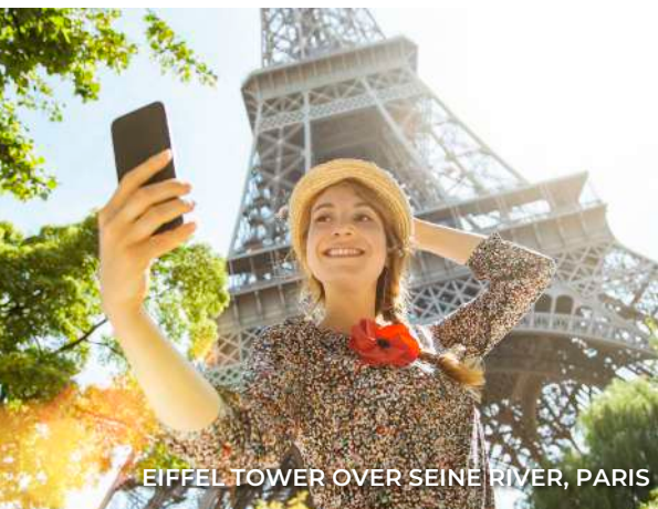
EIFFEL TOWER OVER SEINE RIVER, PARIS

and 17th centuries. Be sure not to overlook Petite Venice , an incredibly charming area where distinctive half-timbered Alsatian houses grace the waterway as it meanders through the city's old fishmonger district. Then, travel to Reims to stay overnight.