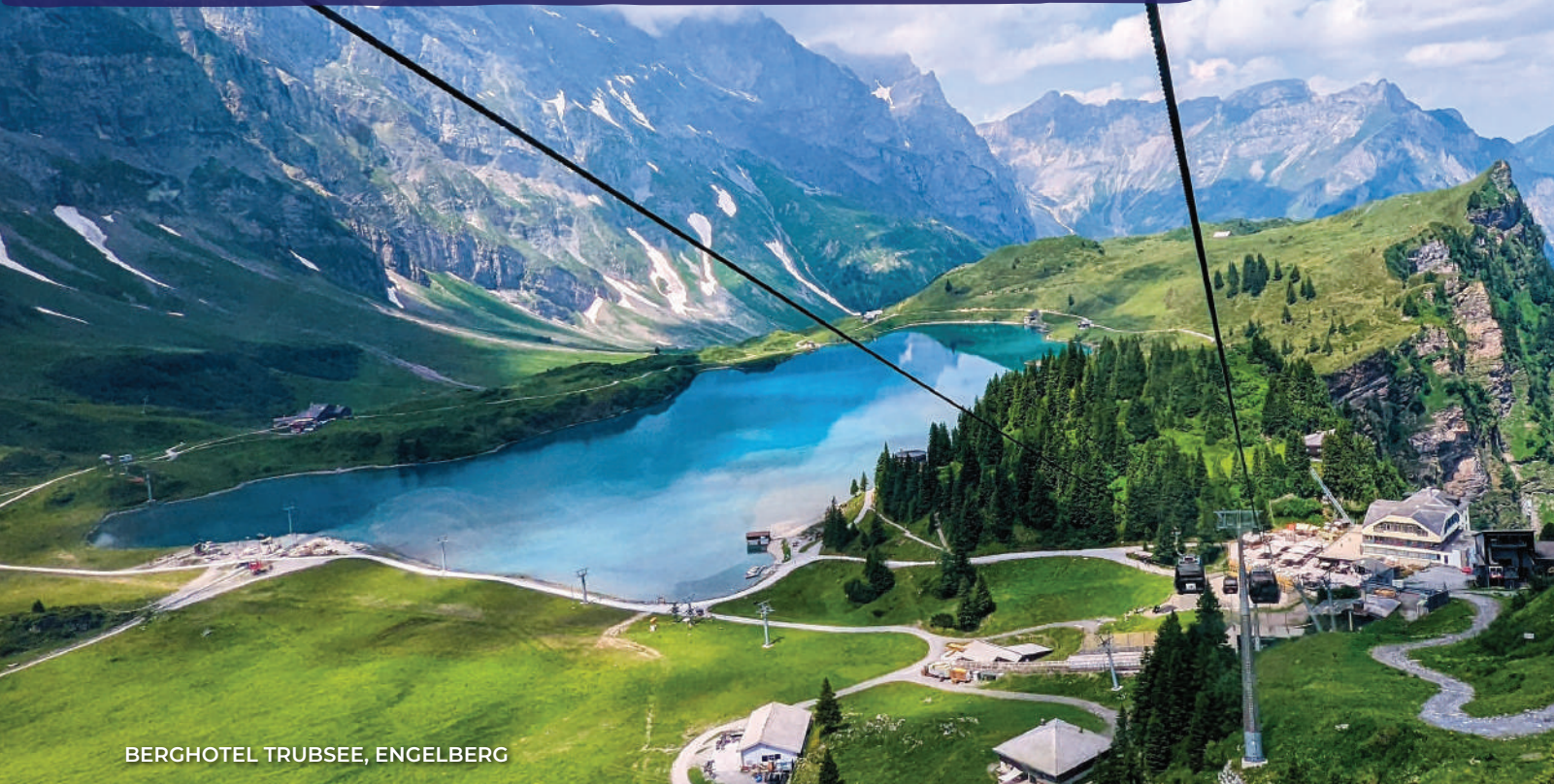
BERGHOTEL TRUBSEE, ENGELBERG